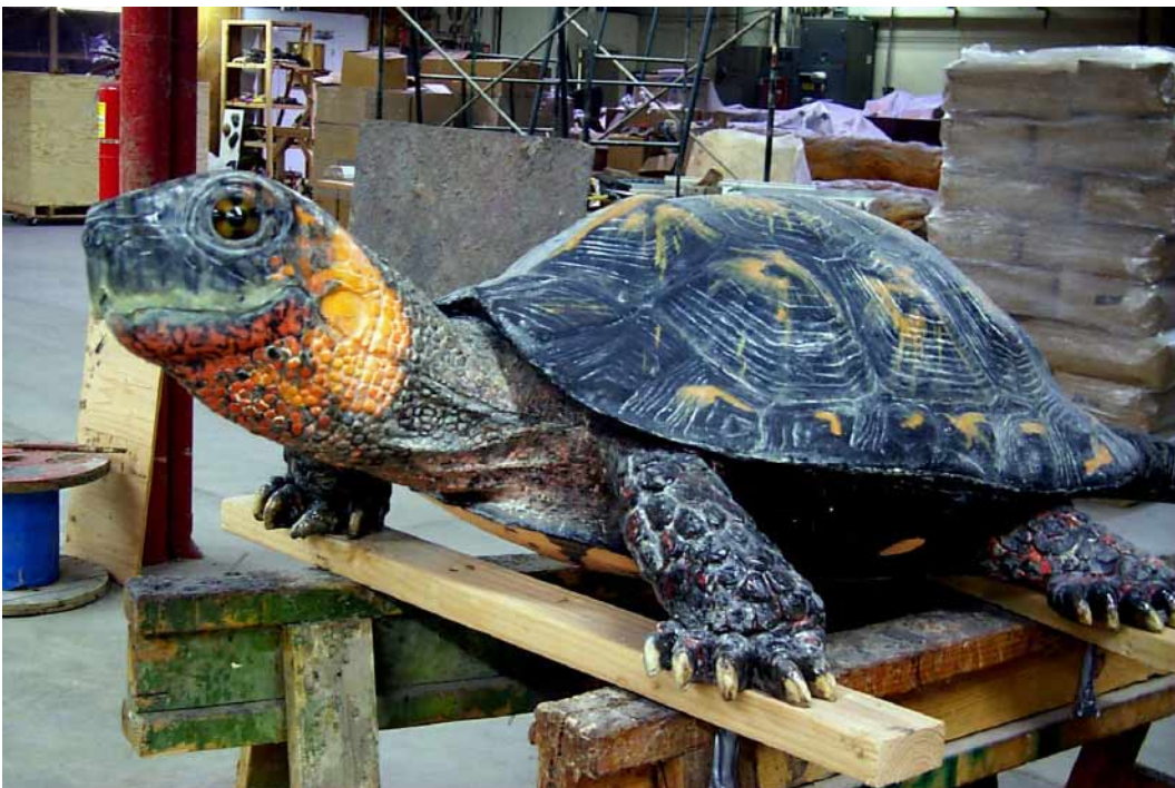
Bog Turtle (Over Size) A04010