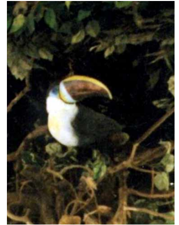
Toucan sp. A02010