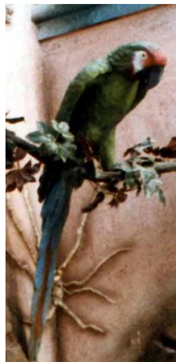
Macaw sp. A0101