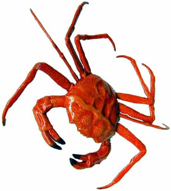
Norfolk Canyon Crab 93000