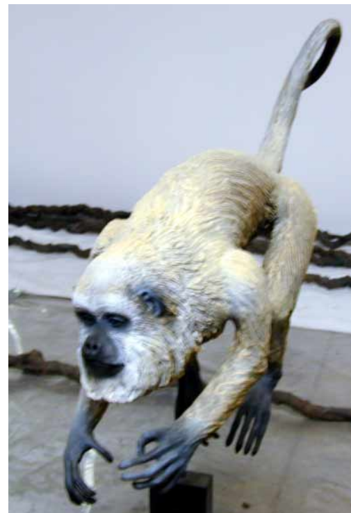
Howler Monkey A03010